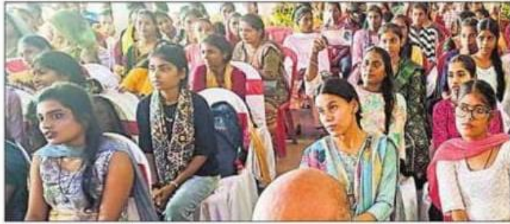
प्रशिक्षण केंद्र पर पहुंची महिलाएं व युवतियां.