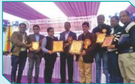
The Mines team displaying their prizes awarded to them at the 29 th MEMCW