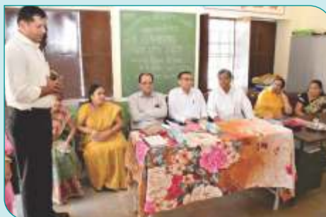
Distribution of school bags at Anganwadi Kendra