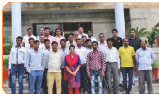
Participants from the program on 'My Environment My Role'

RTC Nimbahera conducted 11 training programs for 213 participants in the month of September, which included 6 Technical and 4 Management programs. The participants belonged to different companies such as Nirma Cement, JK Lakshmi Cement, Gujrat Cement Works and Birla Cement Works.