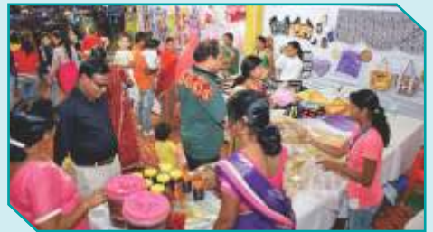
Surbhi Mahila Grih Udyog stall at the exhibition