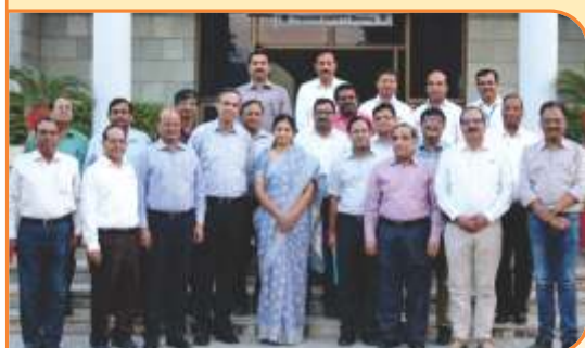
Executives from the training program - Performance Feedback Culture

RTC - Nimbahera conducted 10 training programs in the month of October which included 6 Technical and 4 Management programs. A total of 199 participants were trained during the month. 137 participants