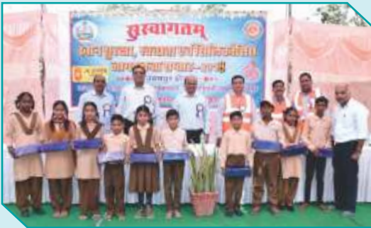
Prize distribution ceremony for students

The prize distribution function was held on 18 th December at Birla Cement Works, Chittorgarh. Our mines from Nimbahera & Mangrol won several awards under different categories.