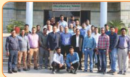
Participants of KEC Safety Program