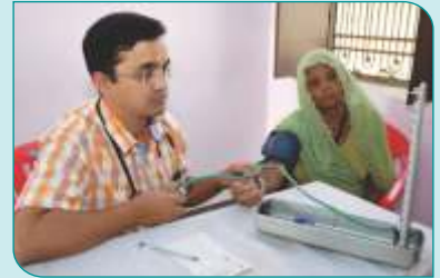
Doctor measuring the blood pressure of a patient