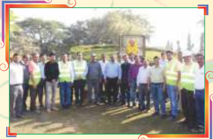
Group Photograph of executives, employees and workers