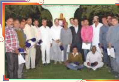
Group photograph of the recipients of long service award