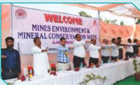
Oath taking ceremony

Ltd., Sirohi. This year, 52 Mechanized Mines participated in different categories. All five mines of JK Cement participated in the Mechanized Opencast Mines Group & won a total of 13 Prizes in different categories such as afforestation, waste dump management, sustainable development etc.