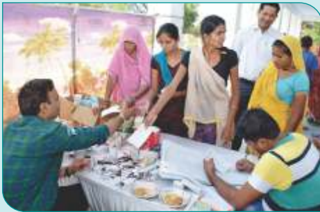
Distribution of free medicines

Social activists and other senior citizens who were present on the occasion expressed their gratitude towards Nimbahera Plant for organizing the camp and hoped that the Company would continue to support such social welfare initiatives in the future.