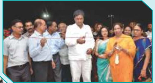
Mr. Shrichand Kriplani - UDH Minister inaugurating the JK Super Cement exhibition

The attendees also appreciated the efforts of Surbhi Ladies Home Industries especially, their contribution towards helping the economically backward women earn their livelihood and respect in the society. Company officials, various dignitaries and journalists attended the exhibition.