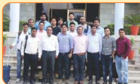
Participants from Orientation on Cement Manufacturing Process program

RTC - Nimbahera conducted 10 training programs in the month of October which included 6 Technical and 4 Management programs. A total of 199 participants were trained during the month. 137 participants