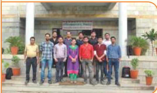
Participants from the program 'Creative Analysis'

RTC conducted 8 training programmes in the month of April which included 6 Technical and 2 Management programs during which a total of 119 participants were trained. 59 participants from JK Cement and 60 participants from different companies including Hindustan Zinc Ltd., Vikram Cement, Digvijay Cement, Gujrat Cement Works and Nirma Cement Ltd. attended the training session and truly utilized the opportunity.