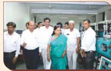
Chief Minister visiting Government Hospital, Nimbahera