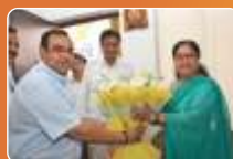
Hon'ble Chief Minister of Rajasthan visits JK Cement Works, Nimbahera