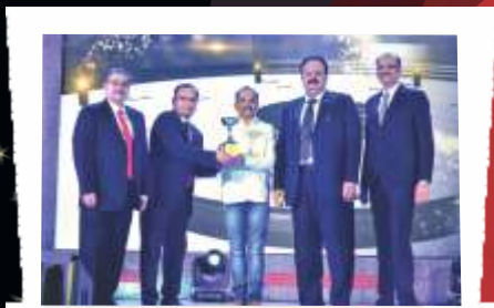
Banshankari Steel Center - Winner, Kolhapur (Maharashtra)