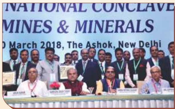
Awardees and participants with the Guests