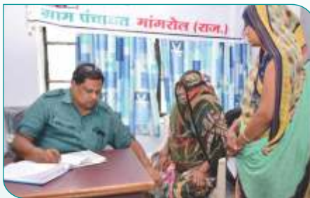
Orthopaedic specialist examining a patient