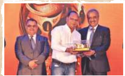
Global Marketing, North East - Winner, Wall Putty