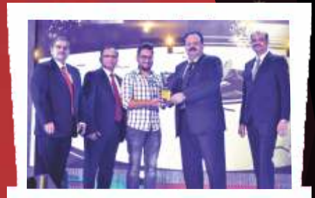
Savani Traders - Winner, Kolhapur (Maharashtra)