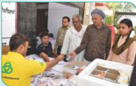
Free distribution of medicines