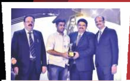
KS Steel Traders - Winner, Malappuram (Kerala)