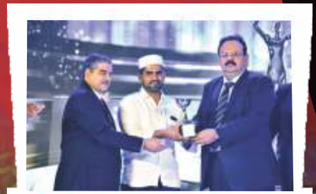
Metro Cement Sales Corporation - Winner, Dakshina Kannad (South Karnataka)

felicitation ceremony were woven seamlessly into the fabric of the meet to recognize the exemplary work done by our valued channel partners in the previous financial year and also to motivate them to surpass their own performance.