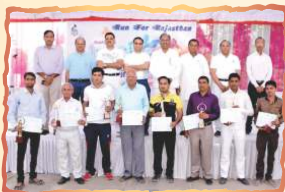
Best performers presented with citations on Rajasthan Diwas