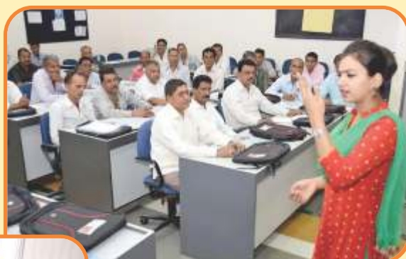
The workshop in progress