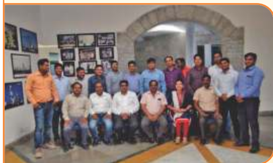
Participants of orientation program on Cement Manufacturing

In the month of March, RTC also conducted three training programmes at Nirma Cement. 96 participants were trained during these three onsite training programmes.