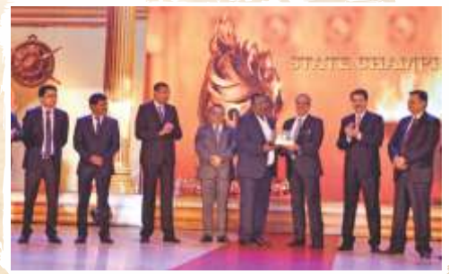
Shiv Shakti Stores, Bihar - Winner, White Cement