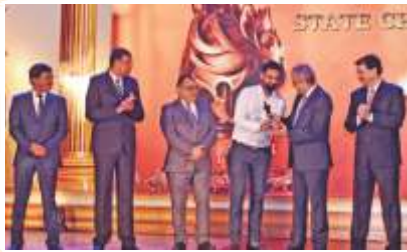
Shubh Labh, Jharkhand - Winner, White Cement