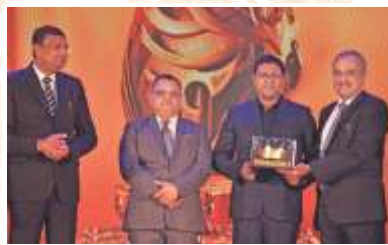
Ravi Hardware Stores, Bihar - Winner, Wall Putty