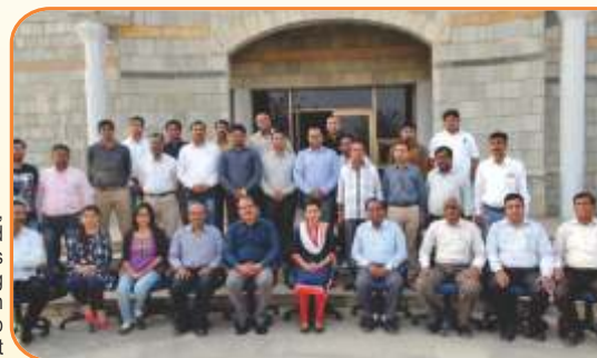
Participants, faculty and senior executives from the training program on Leadership Development