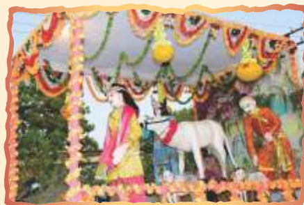
The chariot during the Shobha Yatra