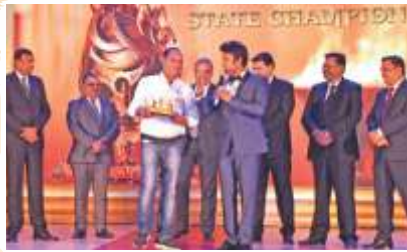
Global Marketing, North East - Winner, Wall Putty