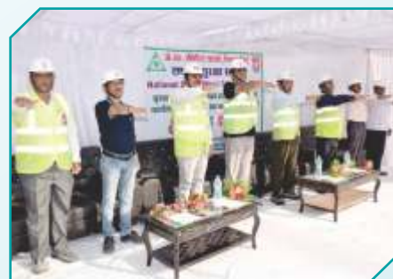
Participants taking the safety oath during Safety Day celebration at Nimbahera