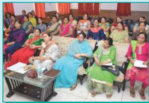
Audience viewing the baking workshop organized at Surbhi Ladies Club