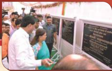
CM laid the foundation of JK Concert Hall

Smt. Raje also laid the foundation stone of JK Concert Hall and inaugurated the CC Road at Gram Panchayat – Phalwa that was built with the financial support of JK Cement as a part of its CSR initiatives.