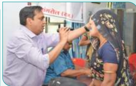
ENT specialist examining a patient