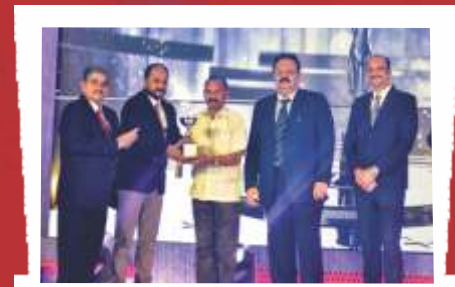
Shri Swami Samarth Trading Company - Winner Bagalkot, (North Karnataka)

In line with this, various entertaining performances were organized for them including the enthralling Bahubali themed dance, Ganesha act and various other artists. Motivational speeches and the