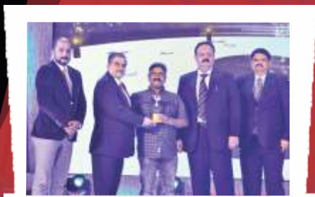
New Laya Associates - Winner, Kozhikode (Kerala)

JK Cement has always focused on building a strong network of channel partners based on the firm belief that they play a crucial role in the Company's overall growth. To celebrate this cherished bond, the Annual Dealer Conference for JK Super Cement was held on 23rd March in Pune. Themed 'Power of U', the meet was attended by 550 guests from Maharashtra, Karnataka, Goa and Kerala.