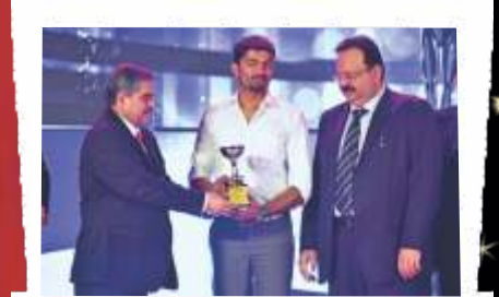
Aishwarya Traders - Winner, Shivamogga (South Karnataka)