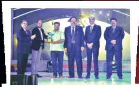
Sangmeshwara Steels - Winner, Raichur (North Karnataka)