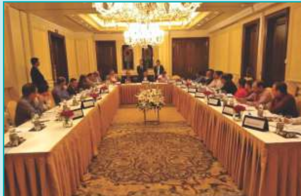
Bankers attending the meeting