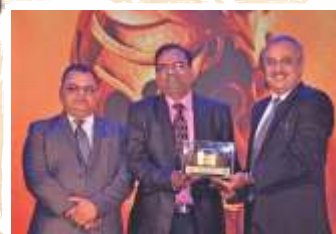
New Jaipur Marble House, West Bengal - Winner, Wall Putty