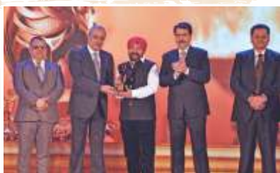
B.R. Traders, Chattisgarh - Winner, White Cement