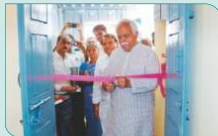
Inauguration of the Laboratory by the Chief Guest