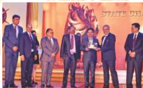
Satish Enterprises, West Bengal - Winner, Wall Putty