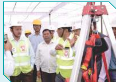
Demonstration of usage of safety belt