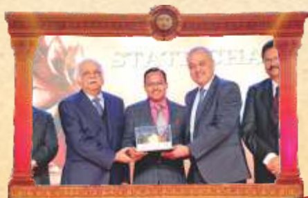
Pratik Cement Agency - Winner (Wall Putty), Varanasi