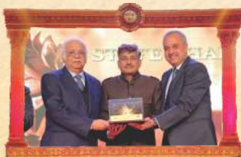
Kiran Paints - Winner (Wall Putty), Ghaziabad