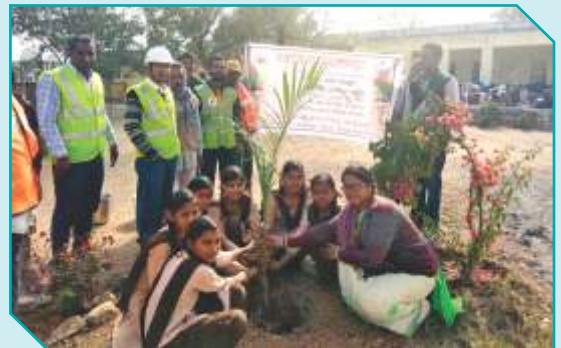
Plantation under Swachhata Pakhwada at Govt. Upper Primary School, Charlia