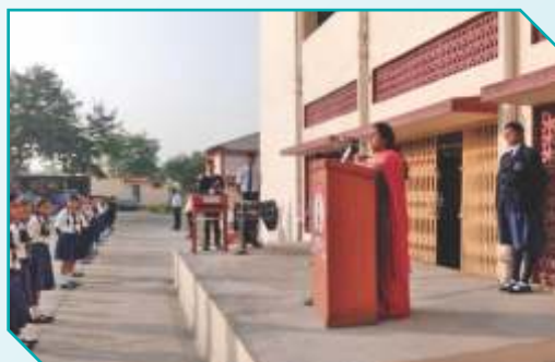
A teacher from Humanity Department addressing the assembly