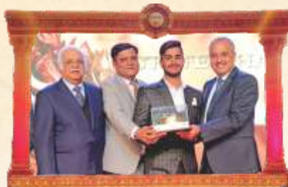
V. Kumar Trading Co. - Winner (Wall Putty), Haryana