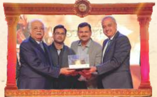
Aggarwal Group - Winner (Wall Putty), Delhi