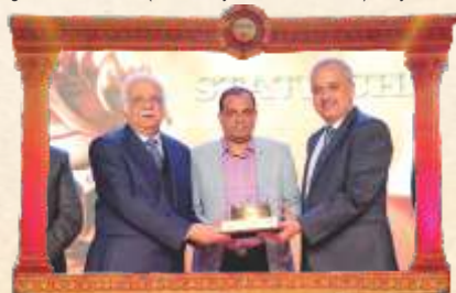
Pradeep & Company Pvt Ltd - Winner (Wall Putty), Nepal