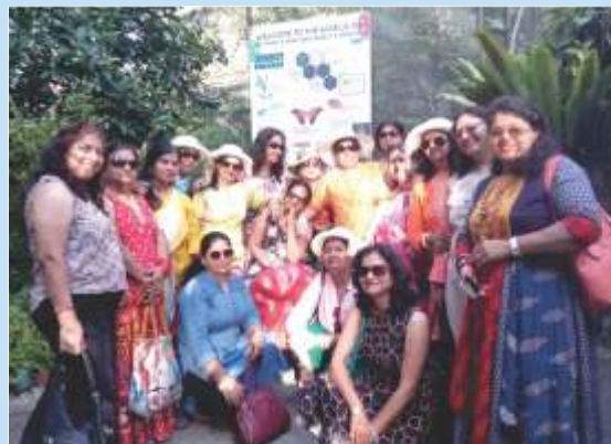
Club members enjoying their visit to Sentosa Island