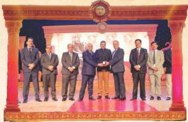
BLK Enterprises Pvt. Ltd. - Winner (White Cement), Delhi