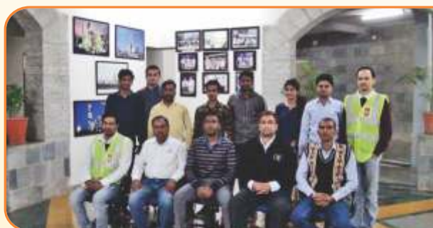
Participants from the orientation program organised for Marketing Team