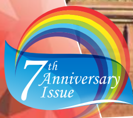
Red Fort, Delhi