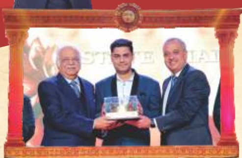
Kapoor Marketing - Winner (Wall Putty & White Cement), Kanpur