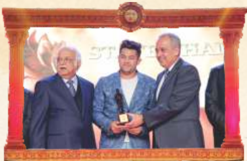
Jain & Sons - Winner (Wall Putty & White Cement), Himachal Pradesh