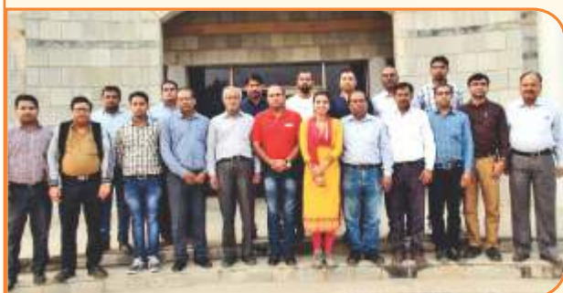
Participants from the orientation program organised for Marketing Team