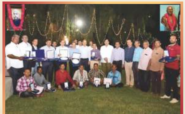
Awardees at the Founders Day Celebrations