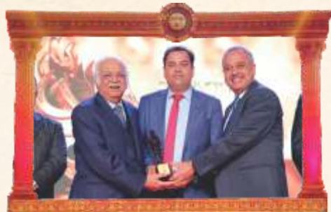
Godrich Enterprises - Winner (White Cement), Punjab