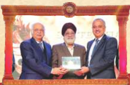
Arora Enterprises - Winner (Wall Putty), Punjab