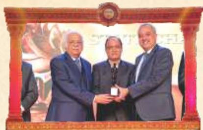
Sidhi Vinayak Pvt Ltd - Winner (White Cement), Nepal

This opportunity not only strengthened our bonds of partnership but also renewed our commitment towards the Company to scale new heights of success and glory.