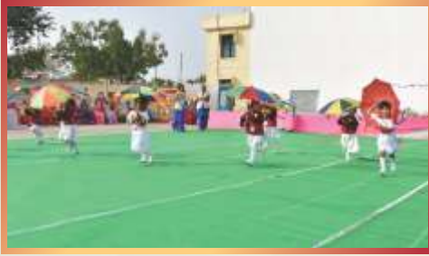
Students participating in a race