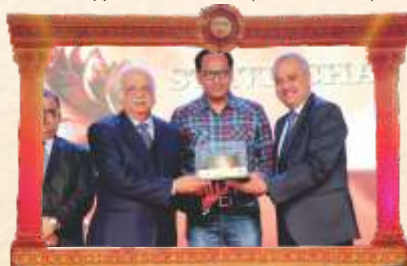
Kicha Marble House - Winner (Wall Putty), Lucknow