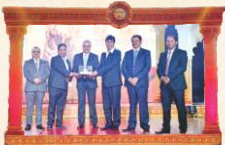
Shree Agencies - Winner (Wall Putty & White Cement), Rajasthan