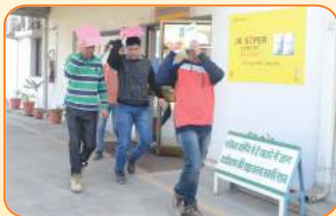
Staff members coming out of the office building during Earthquake Mock Drill

An awareness message was also imparted to the gathering regarding preventive measures to be taken during such disasters.