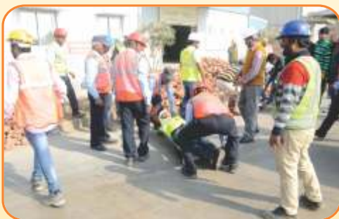
A scene of rescue during earthquake mock drill