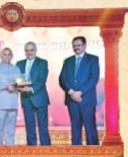
Winner (Wall Putty), Gujarat