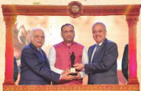
Shri Ram Trading Company - Winner (White Cement), Ghaziabad