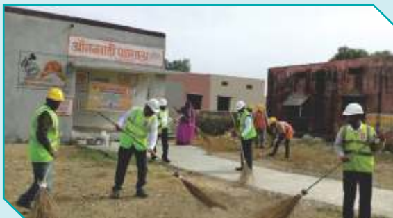
Cleanliness work done under Swachhata Pakhwada at Murlia Aganwadi