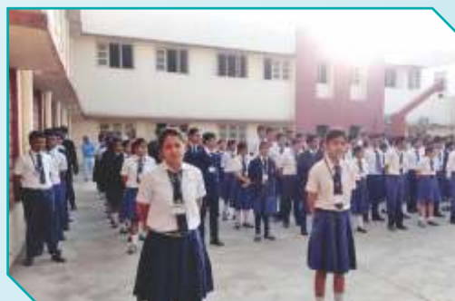
Students gathered to celebrate National Education Day