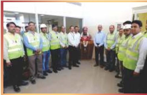
Unit Head along with other staff members on the occasion