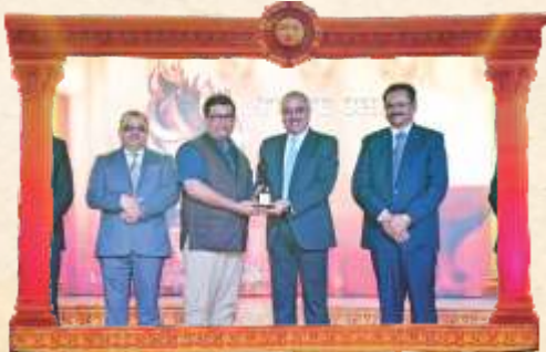
Shakti Marketing - Winner (White Cement), Gujarat