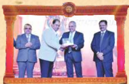
Tech Pro Marketing - Winner (Wall Putty), MP 1