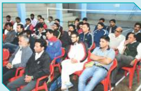
Players from different cement plants at the tournament