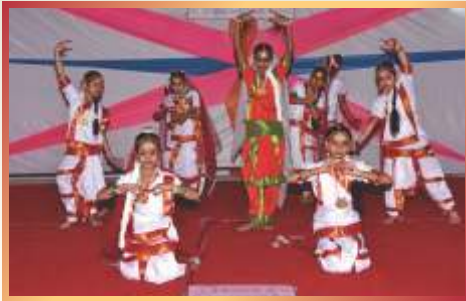
Dance performance by the students