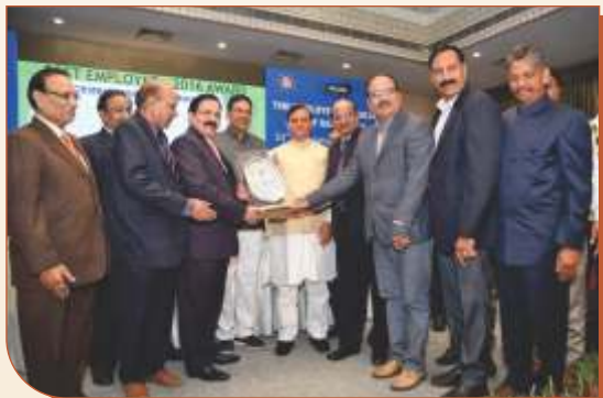
The Nimbahera team receiving the trophy from the Chief Guests