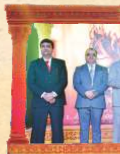
Red Rose Corporation -