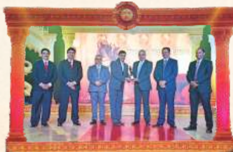
Friends Supplier Co. - Winner (White Cement), Rajasthan