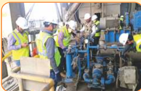
Jharli Team members during TPM work