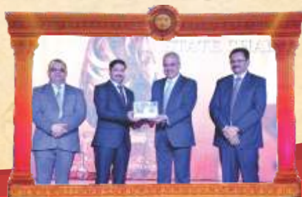
Satyam Enterprises - Winner (Wall Putty), MP 2