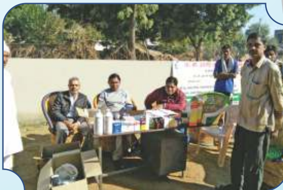
JK Trust team with the villagers at the Animal Treatment Camp

The camps were attended by the village sarpanchs and farmers from the respective villages. The initiative was highly appreciated by everyone present.