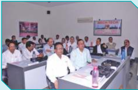
Senior Executives participating in Mech-Tech Summit