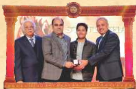
Payal Iron & Hardware Traders - Winner (White Cement), Haryana

The highlight of the event was the rib tickling act by the Comedy King, Sunil Grover. Bringing the house down with his antics, he had the guests in splits. They couldn't get enough of him and didn't want the interaction to come to an end.