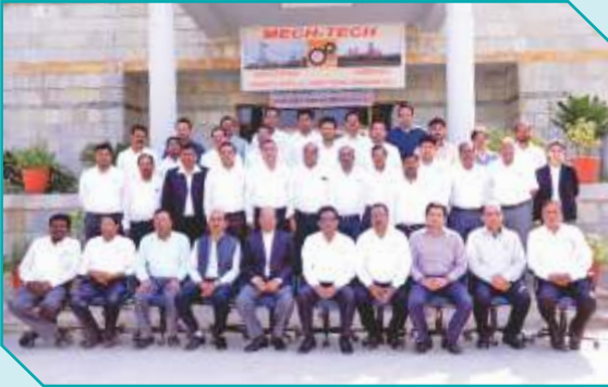
Group photograph of Executives in Mech-Tech Summit

The Technical Heads and the Senior Technical Managers present at the seminar discussed various issues and gathered new information. More than 40 Senior Technical Executives from different units were present at the meet.