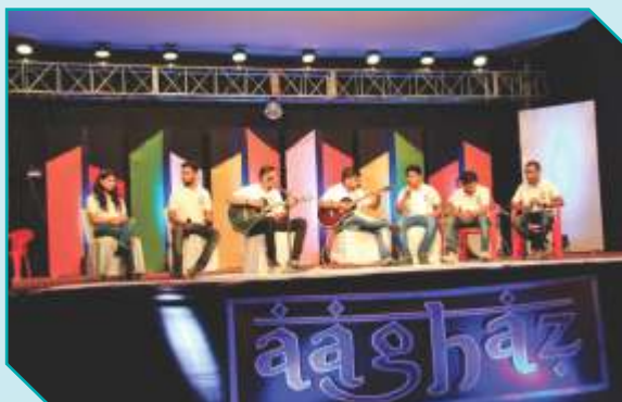
Musical program presented by young engineers