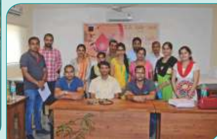
Jharli Staff members with HSBTC team members during the Blood Donation Camp