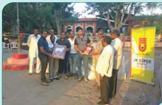
Jharli Team members being felicitated by Shree Krishna Gaushala, Charkhi Dadri