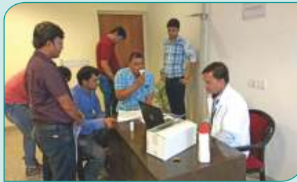
Staff members at the Spirometry Test counter

JK Cement Works, Jharli organized a two day Health Checkup Camp on 14 th & 15 th September. The camp was organised by the HR Department in association with the doctors from Express Clinics Pvt. Ltd., New Delhi. All the staff members and 118 workers underwent physical examination that included Spirometry test (Lung Function Test), Audiometry, Vision Test, ECG, X-ray and Blood Test. During the camp, staff and workers were advised on treatment of skin, eyes, ears & lung related diseases.