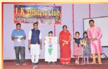
Fancy dress competition