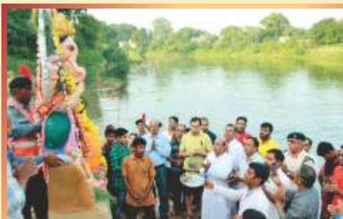
Devotees immersing the idol of Lord Ganesh

JK Cement Works, Nimbahera celebrated Ganeshotsav on 25 th August, with great reverence, faith and enthusiasm under the auspices of JK Officers' Club, Surbhi Ladies Club and the Ganesh Utsav Committee. The Utsav commenced with the establishment of the idol of Lord Ganesh.