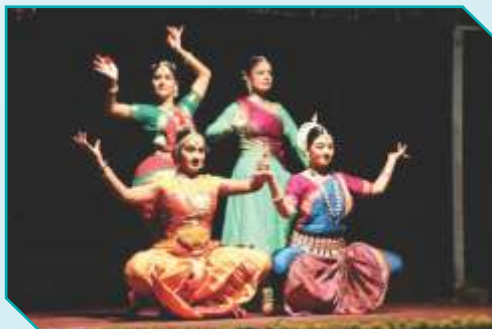
Classical dancers performing during the event