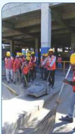
Staff and workers during Swachha Abhiyan at Jharli

JK Cement Works, Jharli celebrated Gandhi Jayanti in a unique manner. On that day, special initiatives were taken to make the plant cleaner and greener. The staff and the workers worked together as a team to make the plant 'Swachha'. The mission of the initiative was to 'transform the Plant into an orchard'.