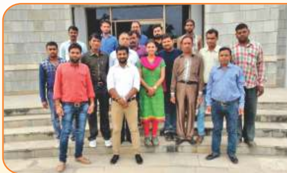
Participants of Occupational Health & Safety program

The third phase of 'Training of Trainer' program was also conducted during the month for process-batch of RD Mines. 4 participants were trained during the 3 day training program, which completed the TOT module for HZL Dariba.