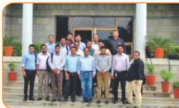
Participants from the orientation program organised for Marketing Team