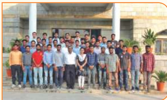
Participants from the orientation program for DET-GET

The third phase of 'Training of Trainer' program was also conducted during this month for Mechanical and Instrumentation batch of RD Mines, where 10 participants were trained during the course of the 6-day training program.