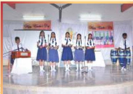
Children of Kailash Vidya Vihar performing at the event

Every year, Teacher's day is celebrated on 5 th September to commemorate the birth anniversary of India's second President, Dr Sarvepalli Radhakrishnan. He was an educationist, philosopher, statesman and a writer.