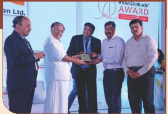
Professor Mr. P.J. Kurien - Hon'ble Deputy Chairman, Rajya Sabha (Parliament of India) presenting the award to the team from JK Cement