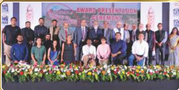
Winners of the 26 th Architect of the Year Awards

aspirants from across the globe. We are very pleased to see that AYA has emerged as the most significant platform for recognizing the outstanding talent in the architectural fraternity."