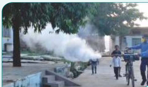
Fogging pest control in villages