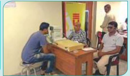
Staff members at the vision test counter