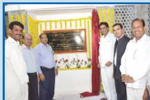
Inauguration of new building of JKIT