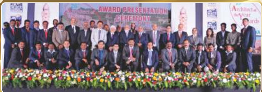
The AYA Secretariat along with other Staff Members

aspirants from across the globe. We are very pleased to see that AYA has emerged as the most significant platform for recognizing the outstanding talent in the architectural fraternity."