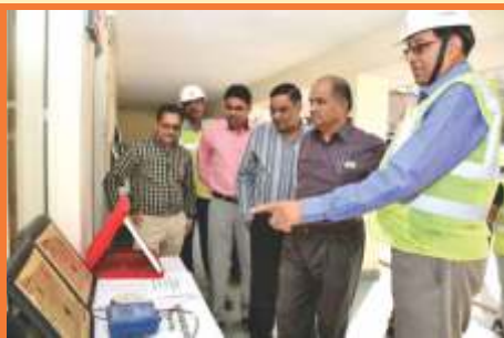
Dignitaries keenly viewing the model presented at the exhibition