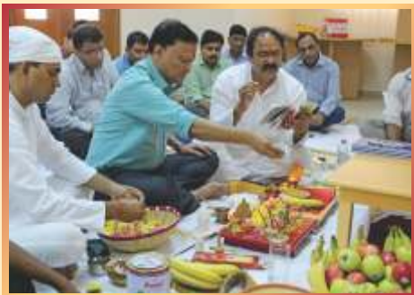
Diwali Puja at the Plant

The employees were also treated to a delicious lunch. Furthermore, the plant distributed sweets to all their employees, contract workers and others present for the occasion.