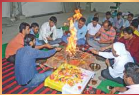
Team Jharli participating in Yajna