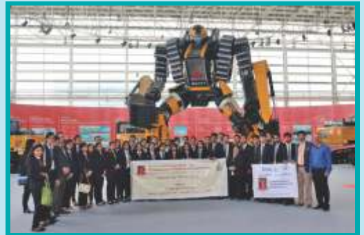
Students during the Industry visit to SANY Heavy Machine Company, Shanghai