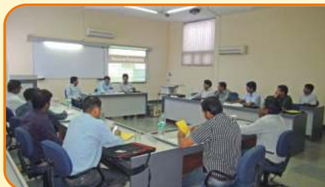
Program on Electrical Energy Conservation and Management in progress

A one day management program on 'inter personal skills' was organised for frontline/ middle management executives on April 15. Fourteen executives from