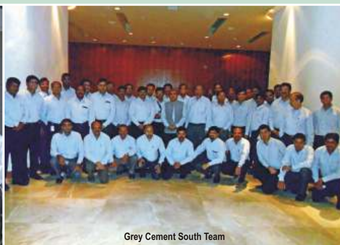
Grey Cement South Team

Taking important lessons from the past year, we, at the J.K. Cement family hope that we can collectively work together towards higher goals and even better performance.