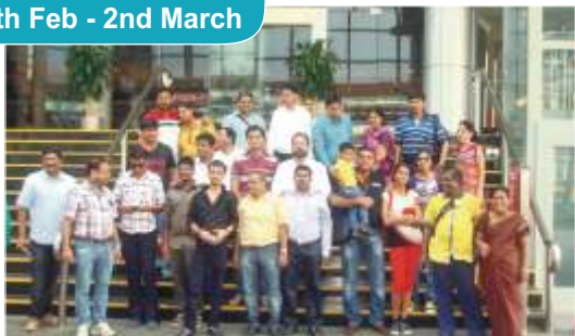
Company officials and dealers during the tour organised from 26th Feb - 2nd March