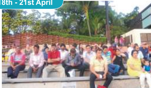
Company officials and dealers during the tour organised from 18th - 21st April