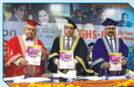
Release of the book - 'Brand Craft'

72 students of the 18th batch of Full-time students were conferred their degree. The ceremony concluded with vote of thanks followed by the National Anthem.