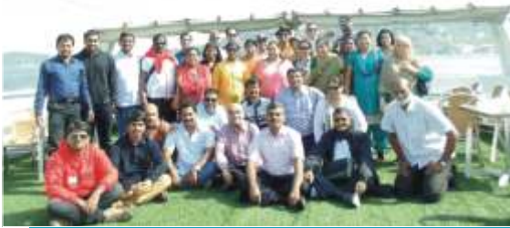
Company Officials and Dealers during the tour organised from 13th - 20th April