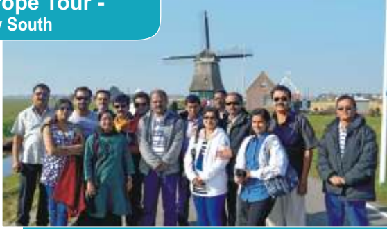
Company Officials & dealers in Amsterdam during the tour organised from 7th - 13th march