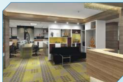
Dubai Office - Inside view