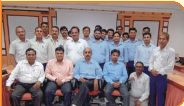
Participants from the training program

This two days training program was conducted for Engineers/Supervisors on April 09-10. Eleven participants from Aditya Cement, Trinetra Cement,