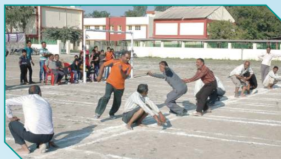
Kho kho being played during the meet