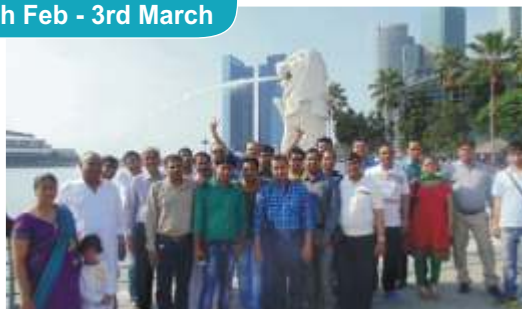
Company officials and dealers during the tour organised from 27th Feb - 3rd March