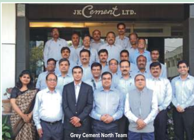
Grey Cement North Team

The Annual Review Meet for Grey Cement South was organized at the The Westin, Koregoan Park. Discussions focused on the way ahead to meet the challenges of the market & network expansion. The conference was followed by a lively and entertaining DJ party.