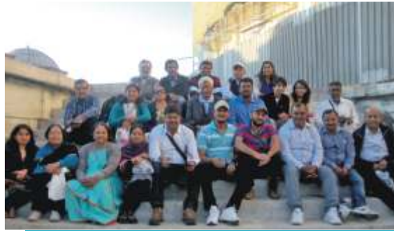
Dealers during the tour organised from 16th - 23rd April