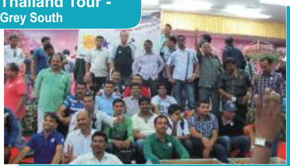
Company officials and dealers during the tour organised from 3rd - 7th March