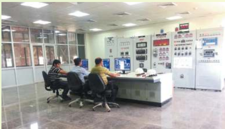
Synchronization team on the job

This will benefit the company multi-fold, ushering in a new era of growth and success.