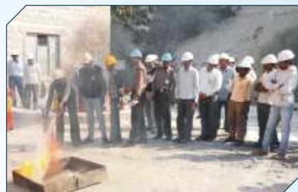
Demonstration on fire fighting