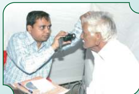
A doctor examining a patient during the camp