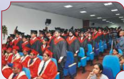
Faculty & Students at the 17th Convocation (Batch-2011-13)

short span of time since its inception in 1995, GHS-IMR has grown multi fold and achieved widespread recognition from industry and academic circles as well as professional bodies.