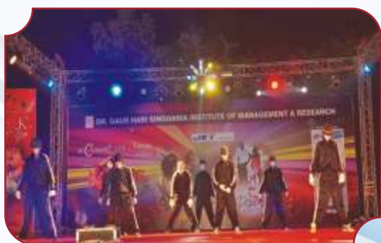
Cultural Programme by Students of GHS-IMR in Management Fest (KOSMOS)