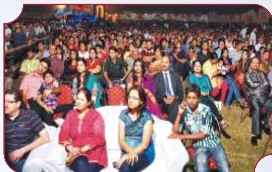
Faculty along with students of different colleges at Management Fest (KOSMOS)

Drawing from the lineage of a leading corporate