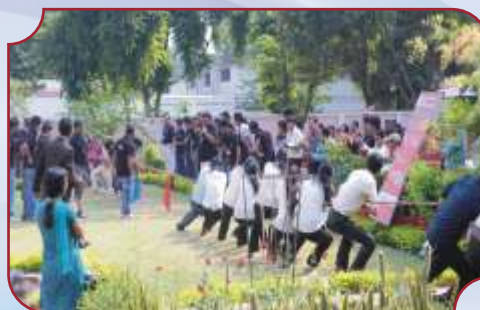
Tug of War competition between students of different colleges at Management Fest (KOSMOS)

Management Education, all over the world, is passing through a paradigm shift because of globalization, liberalization & IT revolution. The