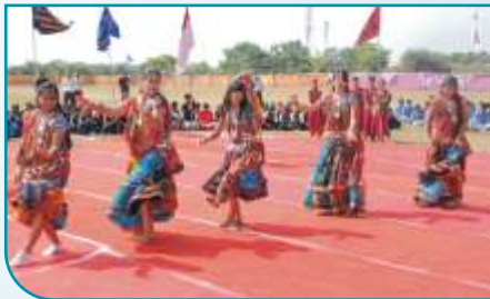
Cultural programme presentation by KVV students