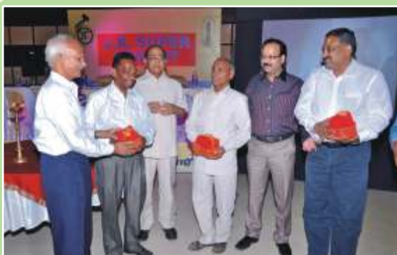
Top dealers being rewarded on the occasion