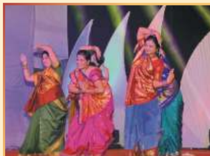
Club members performing on the occasion