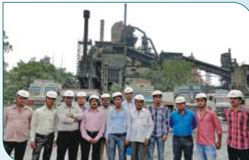
Dealers and Sub-dealers at the plant