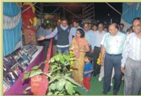
Exhibition at National Dussehra Fair