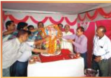
Sthapana of Lord Ganesh at J.K. Cement Works, Mangrol