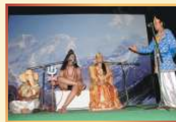
Students of LKSEC presenting a cultural programme