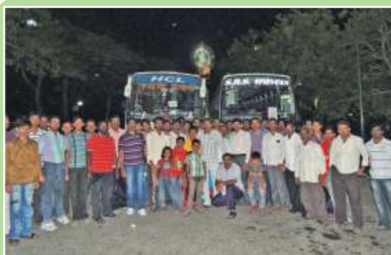
Dealers and company officials during the meet organized in Bangalore