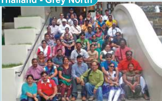
Company Staff and transporters during the tour organised from 20th - 24th September