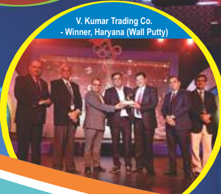
V. Kumar Trading Co. - Winner, Haryana (Wall Putty)