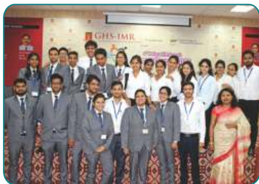
Students of GHS-IMR with a faculty member

Dr. Gaur Hari Singhania Institute of Management and Research (GHS-IMR), in association with The Indian Society for Training and Development (ISTD) organized third National HR Summit 'HumanOource- 2016' on September 10th. The aim of the summit since its inception in 2014 was to have a regular dialogue among professionals/ academicians and business leaders for integrated and inclusive development of Human capital at a national and regional level.