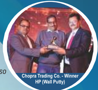
Chopra Trading Co. - Winner HP (Wall Putty)

JK Cement Ltd. is always on the front foot when it comes to rewarding channel partners for their hard work and unstinting support. The event provided us an opportunity to further strengthen our bonds of partnership with our channel partners and together we re-determined to achieve higher and enable the Company scale new heights of success.