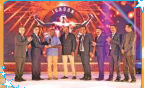
Madhuban Enterprises, Belgaum - Winner, North Karnataka