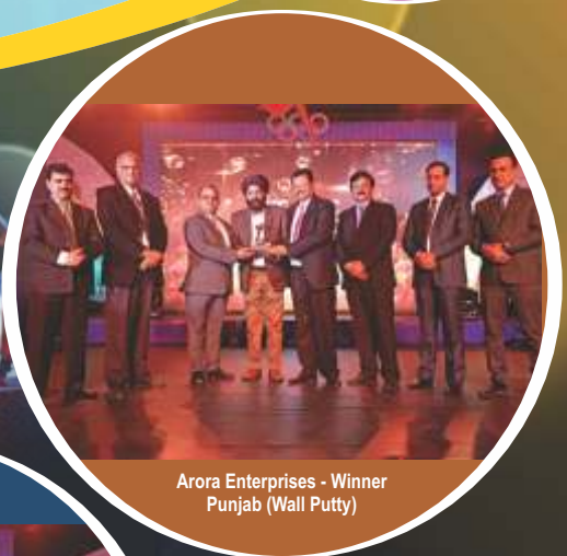
Arora Enterprises - Winner Punjab (Wall Putty)