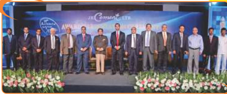
The AYA Secretariat and senior company officials on the occasion