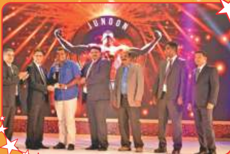
Prabhu Enterprises, Udupi - Winner, South Karnataka