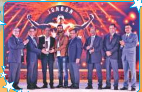
Sarvesh Cement Shoppy - State Champion, Kolhapur