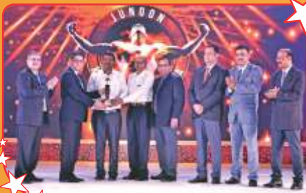
Sankalp Traders - State Champion, Pune

emcee for the event, engaged all the guests with the interactive sessions and fun games during the course of the gala evening. Not only were there awards and recognition bestowed on the channel partners for their performance in the previous financial year, but lots of surprises by way of a lucky draw. Some lucky participants walked away with attractive prizes.