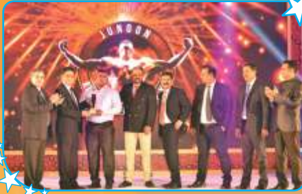
MAG Cement - Winner, Goa