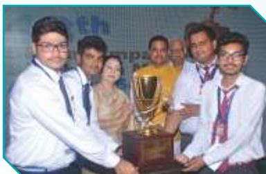
Winners of Science Quiz with the trophy