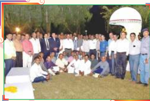
Recipients of the award for long and dedicated association

Founders Day was celebrated with great devotion at both JK Cement Works, Mangrol and JK Institute of Technology.