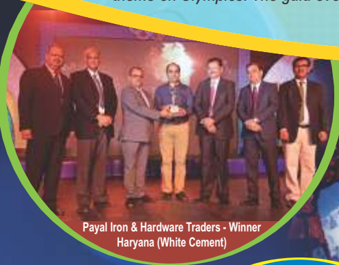
Payal Iron & Hardware Traders - Winner Haryana (White Cement)