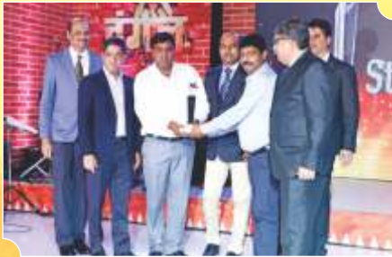
Jagdamba Sales - Winner, Delhi

gathering of 1000 guests from 5 states of North India - Delhi, UP, Uttarakhand, Punjab & Haryana, making it an eclectic mix. As is traditional with our celebrations, top performing dealers were felicitated for outstanding performance in their regions during the meet.