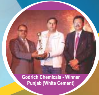
Godrich Chemicals - Winner Punjab (White Cement)