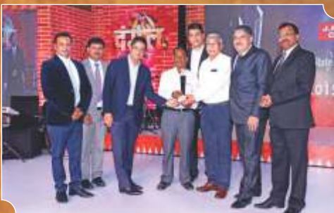
Rameshwar Cement Agency - Winner, UP