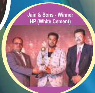
Jain & Sons - Winner HP (White Cement)