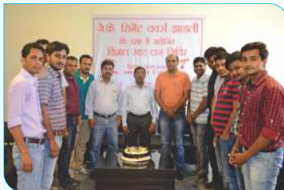
Jharli Team members during the camp