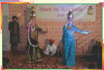
Alankar Musical Group members performing on the occasion

Diwali Milan Samaroh was also organized at the Rest House. It was a beautiful evening where family members of staff were also invited. Alankar Musical Group from Jaipur performed Rajasthani folk dance including Chari, Bhawai and Kalbalia. The group also entertained the children with their puppet show. Everyone thoroughly enjoyed the evening.