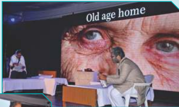
Scene from a drama presented by students