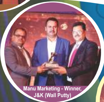
Manu Marketing - Winner, J&K (Wall Putty)