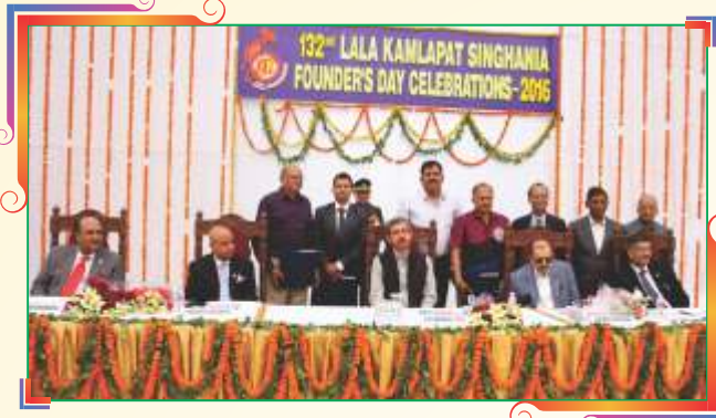
Group photograph of dealers felicitated on the occasion

On this occasion various employees across India were honoured in recognition of their long and dedicated service of 25 years and 40 years with the Organisation. Besides employees, dealers across India were also felicitated for their association with the