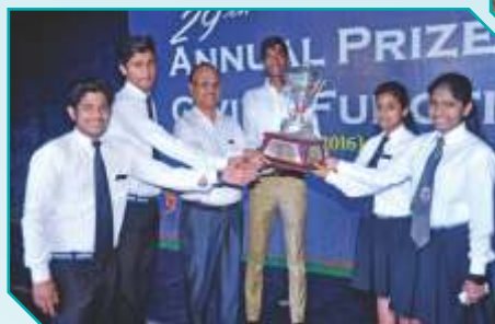
Worked hard for this! students lifting overall trophy