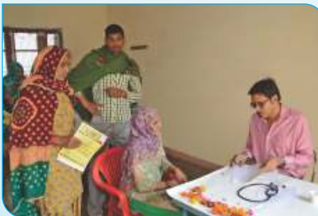
A doctor examining the patients at the camp

Village Sarpanch and the villagers appreciated the efforts of the Company. Around 250 villagers were checked and treated at the camp.