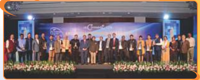
Winners and jury members of 25th AYA

Continuing its success of getting an overwhelming response, this year's AYA received more than 190 entries from India, Bangladesh, Bhutan, Maldives, Mauritius, Nepal, Seychelles, Sri Lanka, Kenya, Uganda and Tanzania.