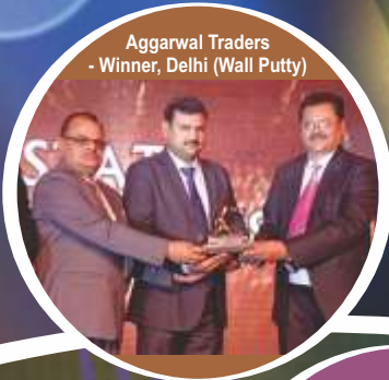
Aggarwal Traders - Winner, Delhi (Wall Putty)