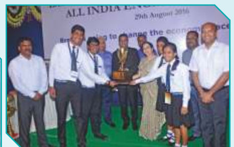
Winners of Hindi and English Debates being felicitated by the Chief Guest