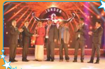
TAS Marketing - Winner, Kerala