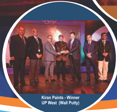
Kiran Paints - Winner UP West (Wall Putty)