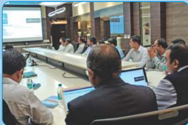
SAP Upgrade Project Kick Off Meeting