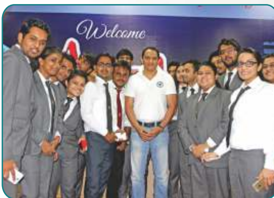
Students of GHS-IMR with Mr. Mohammad Azharuddin

GHSIMR and Sir Padampat Singhania Education Centre (SPSEC) was privileged to play host to Mr. Mohammad Azharuddin, former Indian Cricket Captain and present Member of Parliament, who paid a visit at the Institute to interact with the students.