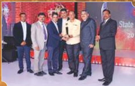
Rajeev Traders - Winner, Uttarakhand