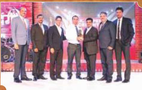
Doaba Cement - Winner, Punjab