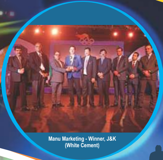
Manu Marketing - Winner, J&K (White Cement)