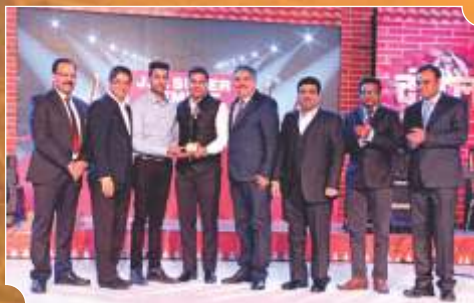
Om Cements - Winner, Haryana