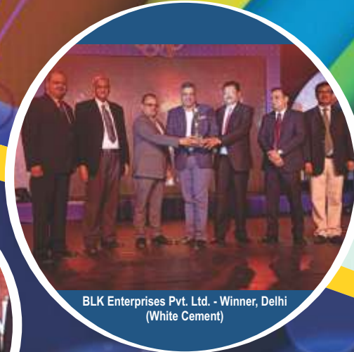
BLK Enterprises Pvt. Ltd. - Winner, Delhi (White Cement)