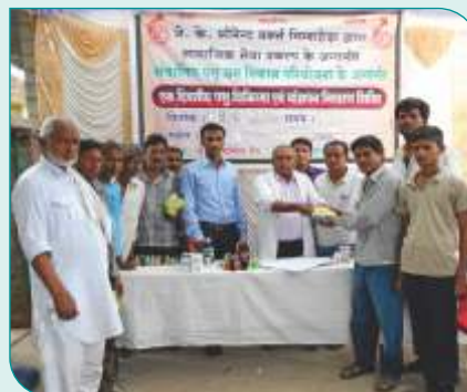
Mineral mixture and anti-worm medicines being given at the veterinary vaccination camp

medicine and mineral mixture were given to them.