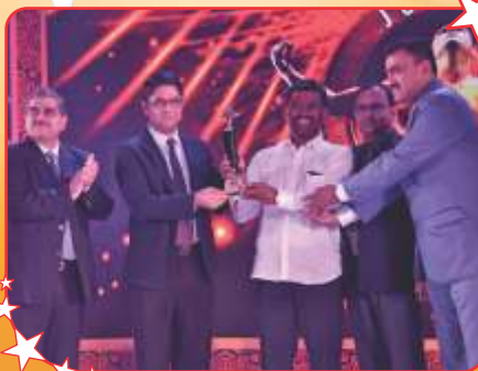
Shri Bramhachaitanya Traders - Winner, Solapur

An outstanding thematic stage was created that left everyone in awe. The