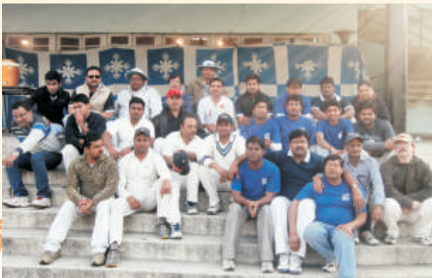
Cricket Match organised at Kamla Club