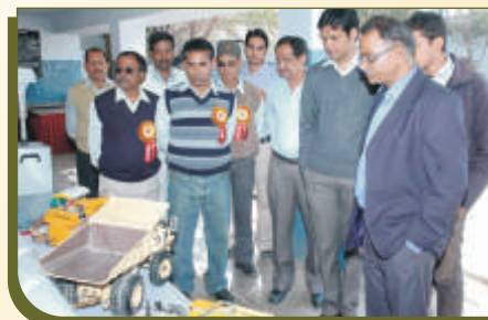
The inspection team viewing the exhibition