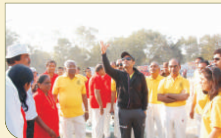
Virender Sehwaag presenting the winning teams with the trophy