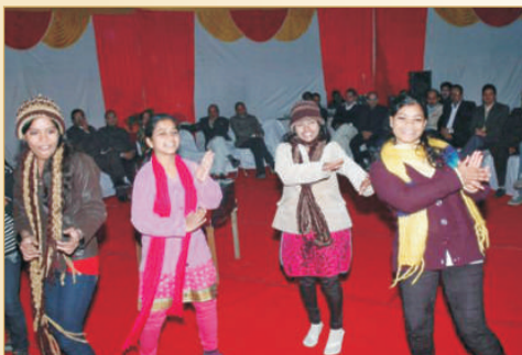
Students of Chhatrawas enjoying themselves

Ladies Club "Surbhi" hosted and facilitated the visit of girls students of Arya Anathalaya, New Delhi on January 7, 2013. The troop reached Kailash Nagar, Nimbahera in the morning and was extended a warm welcome by the Ladies Club members. They then visited the plant where they witnessed the cement manufacturing process.