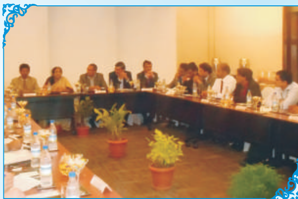
Bankers Meet at Aamby Valley

by IDBI Bank Ltd. at Aamby Valley, Lonavla on 23rd February. This meeting was held to announce financial closure of fresh Term Loan of Rs. 1200 crores sanctioned for the expansion plans. The meeting was attended by Senior Executives from all the Consortium Banks, comprising 12 Banks.