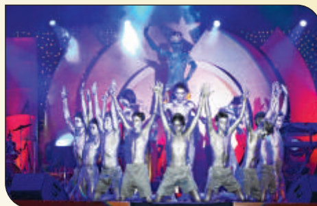
Performance by Prince Dance Group