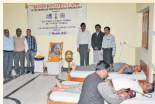
Blood Donation Camp - Gotan