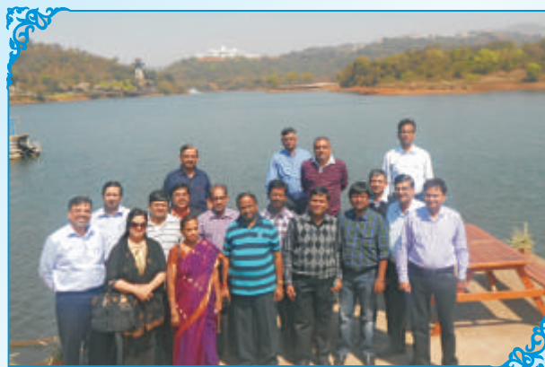
Sight seeing at Aamby Valley