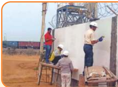
Practical demonstration of value added products.

Demonstration on surface preparation was also carried out for Coarse Putty.