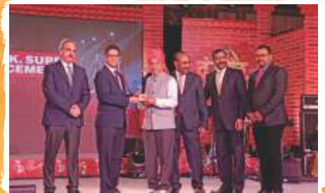
Kalpesh Cement Agency - 2nd Runner Up, Rajasthan Zone 2 (Udaipur)