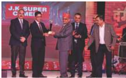
Sogani Agencies - Winner, Rajasthan Zone 1 (Tonk)