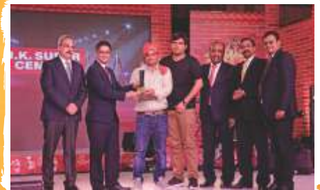
Gyani Building Materials - 1st Runner Up, Rajasthan Zone 2 (Sri Ganganagar)