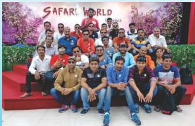
Grey Cement - North