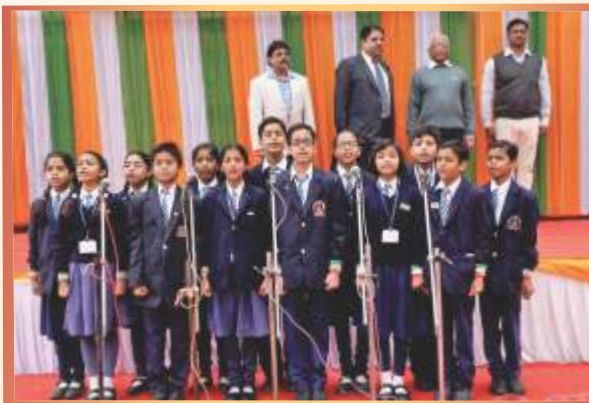
Students of Kailash Vidya Vihar presenting a patriotic song