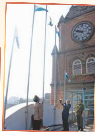
Chief Guest during the flag hoisting ceremony