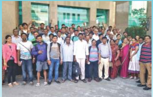
Grey Cement - South