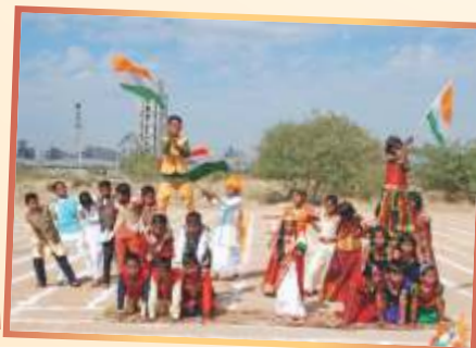
Cultural program by students