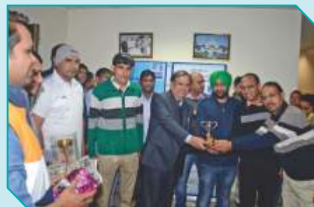
Electrical & Instrumentation Team receiving the Runner-Up Trophy from Unit Head