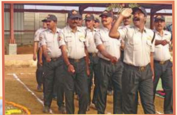
Parade by security guards