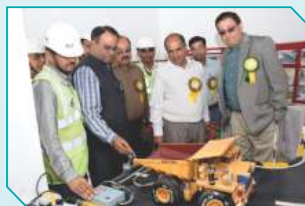
Inspection team viewing the exhibition