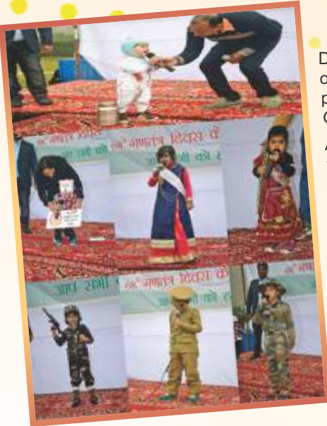
Tiny tots during the Fancy Dress Competition

A small cultural program was organized on the occasion which saw active participation from the staff and their family members. Rewards were also given to workers for their exceptional performance during the year. Meritorious boys and girls from local villages who had won Gold medals in National level competitions were also rewarded by the Unit Head.