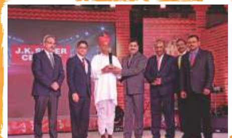
BL Jain and Sons - Winner, Rajasthan Zone 2 (Udaipur)