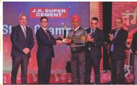
Agarwal Fertilizer - 2nd Runner Up, Rajasthan Zone 1 (Bharatpur)