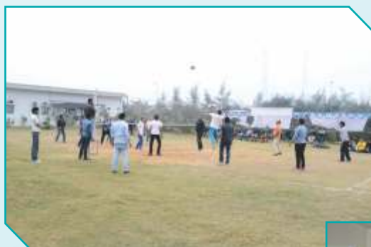
Finals of the Volley Ball Tournament Championship