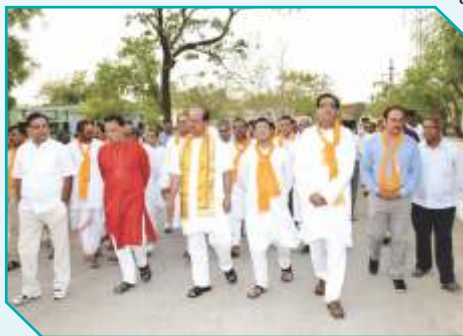
A view of Shobha Yatra