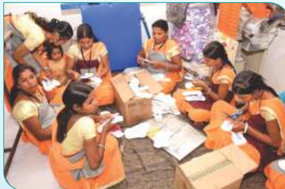
Manufacturing of Sparsh sanitary napkins