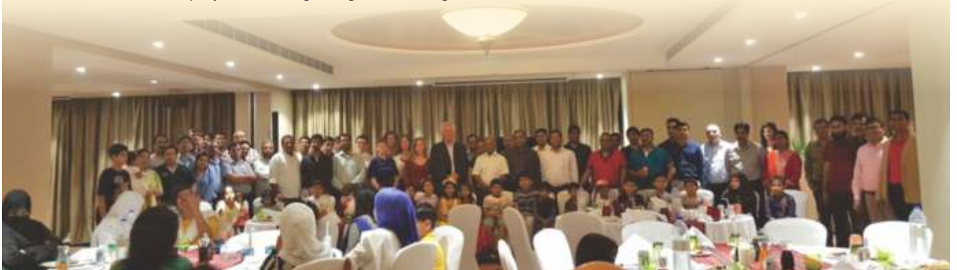
Family get-together at Fujairah

together families of all 12 nationalities and different cultures, which in turn increased the bond between the employees and their families.