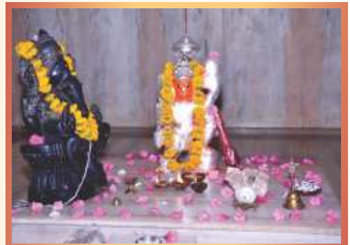
Decorated idols of Lord Ganesha and Lord Hanuman