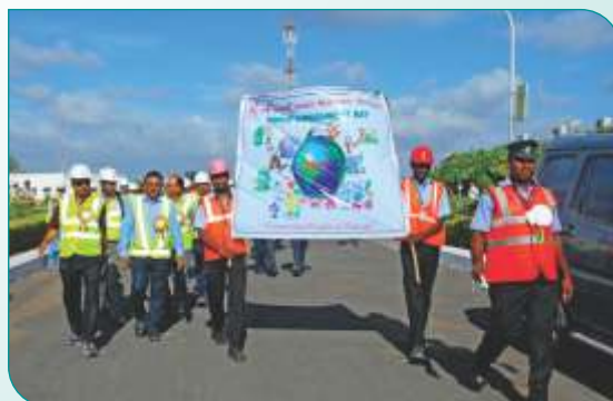
Eco walk from Padam Nagar to Plant