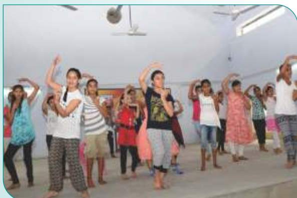
Students learning how to dance