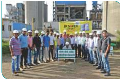
Jharli Staff celebrating Environment Day