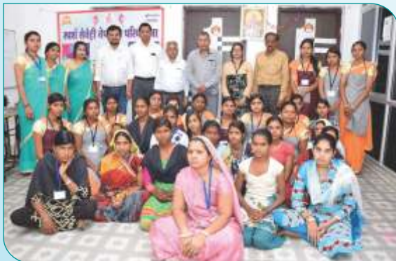
SDM with the Project Sparsh team