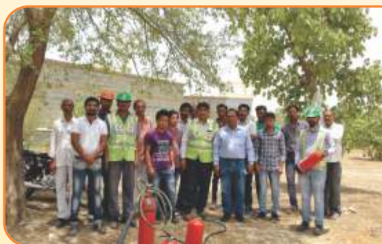
Workshop on electrical hazards & safety conducted on 24 th - 25 th May