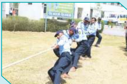
Security staff playing Tug-of-War