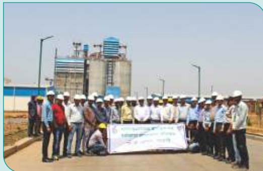
World Environment Day celebration at Katni