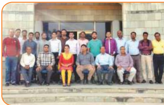
Participants of cost reduction training program organised on 24 th April