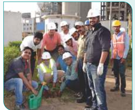
Staff members planting saplings