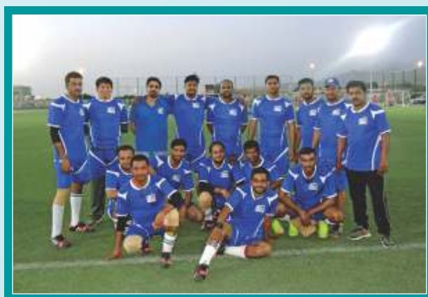
JK Cement Works Fujairah Football Team

The aim of the tournament was to promote the spirit of team building and sportsmanship as well as to make the participants realize the fun aspect of fitness. The event was thoroughly enjoyed by the participants as well as the spectators.