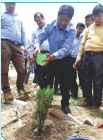
Plantation Drive at JKCTT

JK Centre for Technician Training Pvt Ltd (JKCTT) celebrated the World Environment Day in association with Indian Industries Association, Kanpur & Kanpur Management Association.