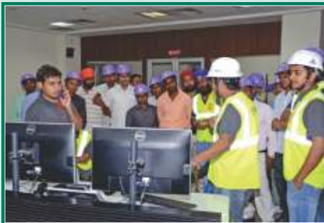
Jharli staff members with the visiting team in the CCR building