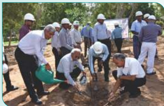
Plantation drive at Gotan

about the environment, conservation of natural resources and the winner was rewarded. This was followed by an exhibition displaying posters and images that aimed at creating environmental awareness amongst the employees.