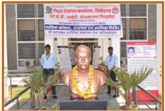
Mega job fair organised at JKIT