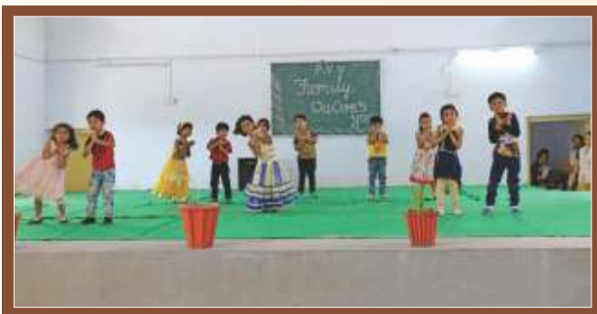
Students of Padam Vidya Vihar performing on Mother's Day