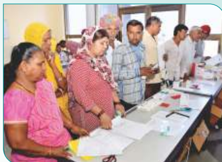
Distribution of free medicines