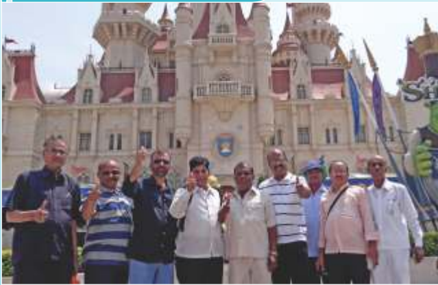
Grey Cement (North and South)