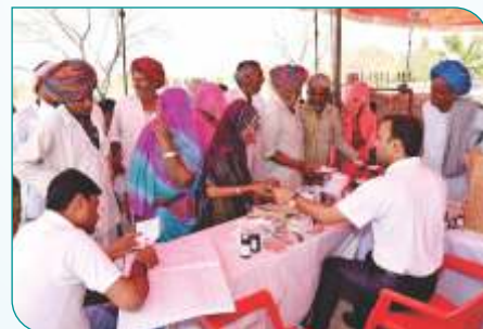
Distribution of free medicines