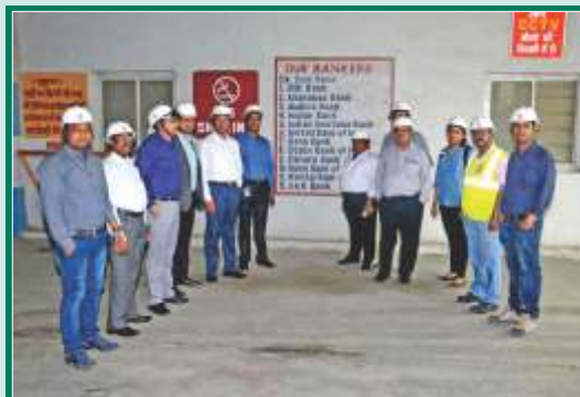
Team of Bankers in the Packing Plant section