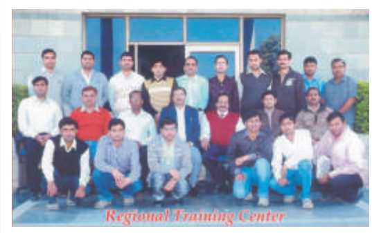
Participants & Faculty members of "Use of Fly Ash in Cement Industry" training programme

Following Training Programs were conducted in the Month of February - 2011