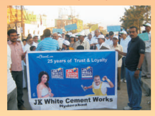
J.K. White Cement supports LEPRA India's Walk for Leprosy 2011 held at Hyderabad