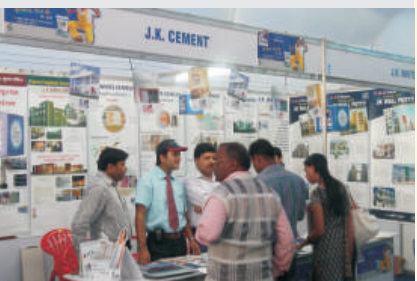
J.K. Cement's stall at the exhibition organised by Decor India Show at Indore