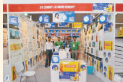
J.K. Cement's stall at Exhibition 'NIRMAN-2010' held at Ahmedahad