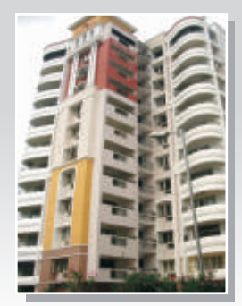
Navin Housing Dayton Heights, Chennai