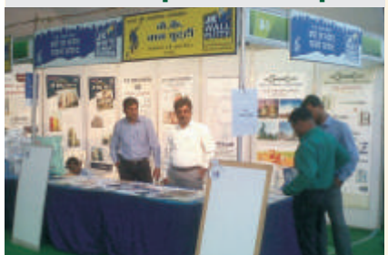
Company Executives at the COSMO Expo 2011 Exhibition at Raipur