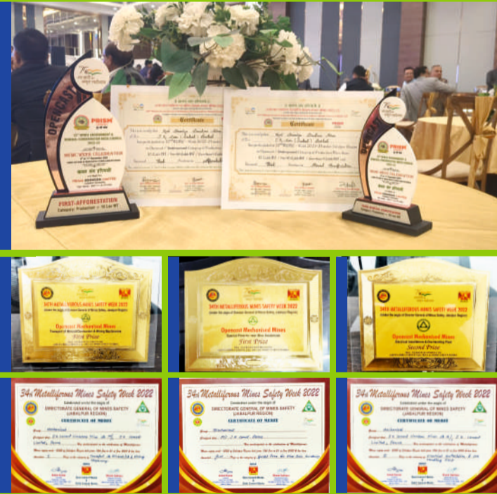
First Prize in Transportation of Mineral / Overburden & Mining Machineries First Prize in Near Miss Reporting (Special Category) Second Prize in Electrical Installation & Ore handling

At JK Cement Works, Balasinor, we were using fossil hydrocarbon oil as a fuel in (Hot Air Generator) HAG to maintain the required temperature in the Cement mill (VRM). Recently, we have introduced a new green technology of Agro Waste HAG which replaces hydrocarbon oil with bio-mass fuel.