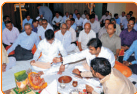
Havan Puja organised on 6th October 2011