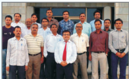
Faculty and participants of the program on 'Positive Attitude for Peak Performance'

A one day training program on 'VFD System' for Supervisors/ Technicians was organised at Vedanta Group – Chanderiya Lead Zinc Smelter, Chittorgarh on Oct 12, 2011. Twenty participants attended the program.