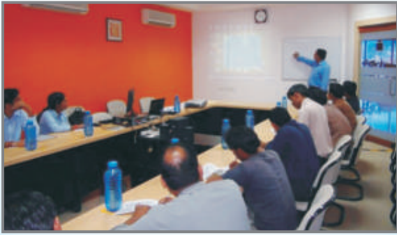
Training program on 'Breaker – Types & Its Maintenance'