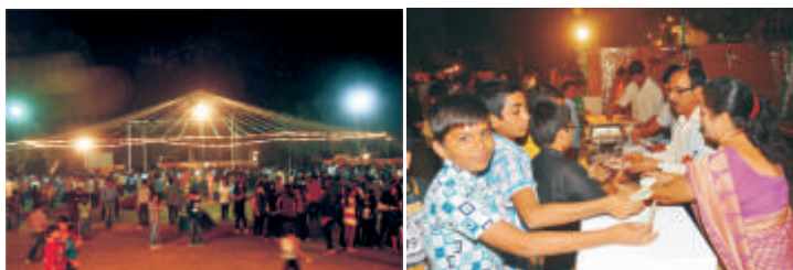
Ladies Club Fete – J.K. White Cement Works, Gotan

fullest. The fete is a foodies' delight with various stalls serving different delicacies. The fete not only provides a platform for social interaction but also fosters unity and harmony