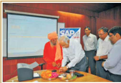
SAP Inauguration at J.K. White Cement Works, Gotan