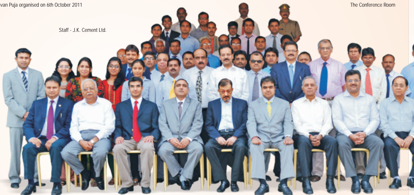
Staff - J.K. Cement Ltd.