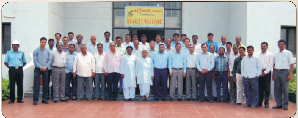
Company officials and dealers at J.K. Cement Works, Muddapur