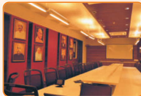
The Conference Room