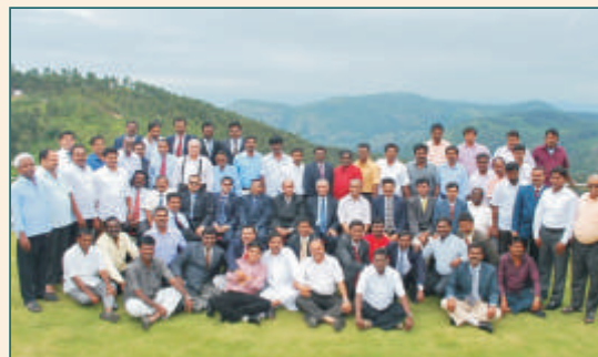
Company officials and stockists in picturesque Yercaud