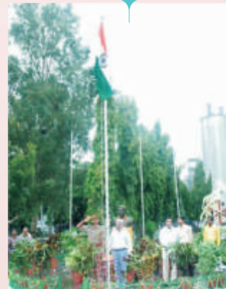
Flag Hoisting on the occasion

the National flag in the presence of employees. In his speech, he reminded all present of the great sacrifice of the freedom fighters and motivated all to contribute in their own way towards development. J.K. Power family also celebrated the day with great enthusiasm.