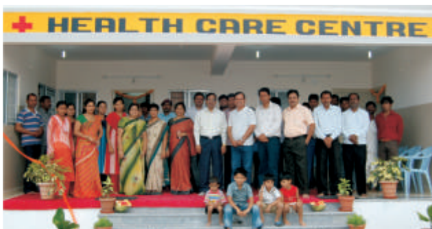
The Health Care Centre at Padam Nagar Colony - J.K. Cement Works, Muddapur