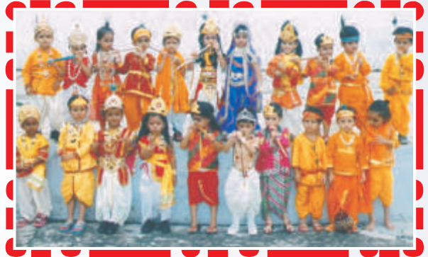
Children at Padam Vidya Vihar dressed as Lord Krishna

Janmashtami was also celebrated at Padam Vidya Vihar with great devotion. On this occasion, a fancy dress competition was organized in which the tiny tots participated with great joy. The students also performed a dance drama based on Lord Krishna's life.