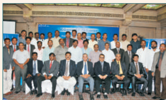
Company officials and stockists at the meet organised from 6 th - 8 th August 2011