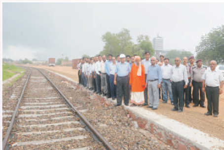
The railway track at J.K. Cement Works, Gotan