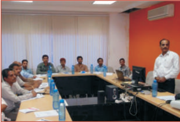
Participants of Hindustan Zinc Ltd. during a training programme

was organised on August 10 - 11 for Managers / Engineers. Fifteen participants from Birla Cement Works, Aditya Cement, Shree Cement, J.K. Cement Works - Nimbahera/Mangrol and Vikram Cement of the region attended the program.