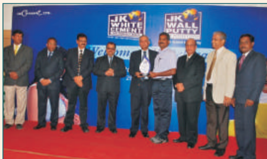
A leading stockist being awarded on the occasion organised from 28 th - 30 th August 2011