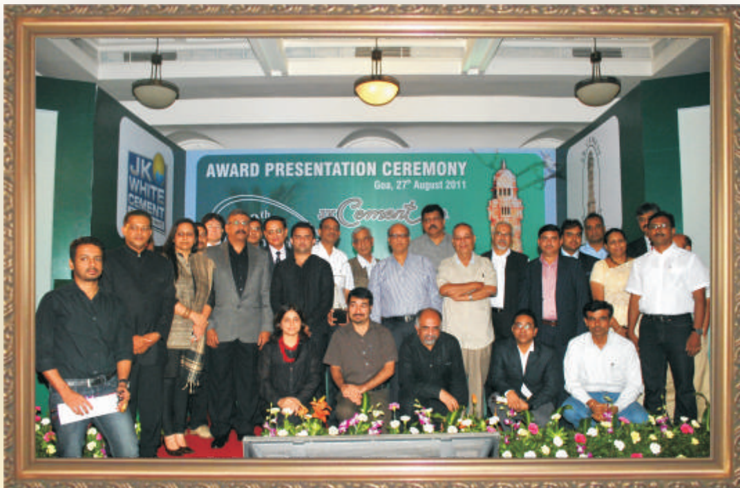
Winners & Participants at the 20 th AYA

Amidst much fanfare, the 20th Architect of the Year Awards, organised by J.K. Cement Ltd., was held in Goa on 27 th August, 2011. Awarding the architects of a better tomorrow, the Gala Event was a great success for the Company and appreciated immensely by the industry.