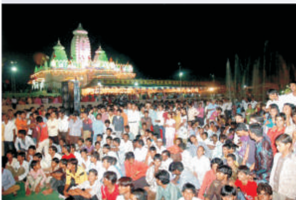
Devotees at the Radhakrishna Temple