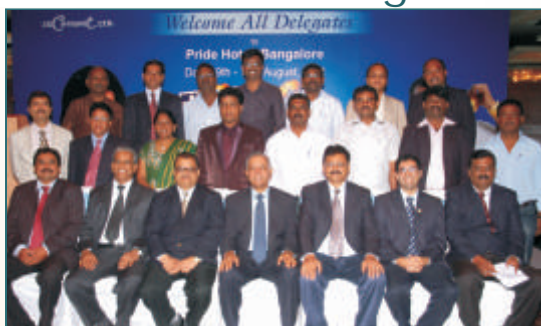
Company officials at the Meet organised from 9 th - 11 th August, 2011