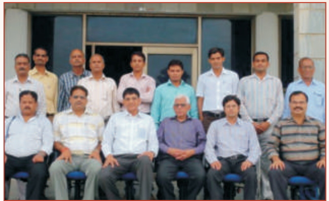
Faculty and participants of 'Achievement Motivation' programme