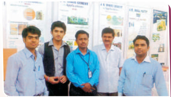
Company Executives at the Furniture & Interior Expo 2011 organised at Nagpur