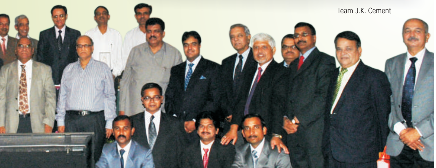
Team J.K. Cement