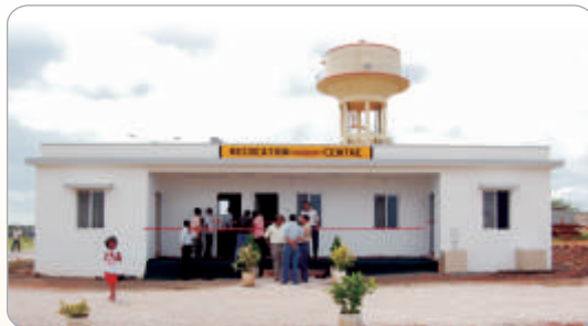
The Recreation Centre at Muddapur