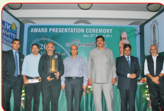
ARCHITECT OF THE YEAR - Chandavarkar & Thacker Architects Pvt. Ltd.