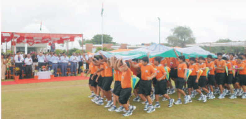
Students of LKSEC with the National Flag