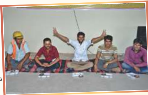
Workers enjoying refreshments on the occasion