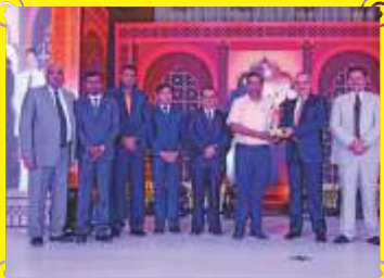
New Jaipur Marble House - Winner, Wall Putty (West Bengal)