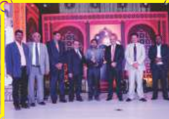
Assam Sales Corporation - 2nd Runner Up, White Cement and Wall Putty (North East)