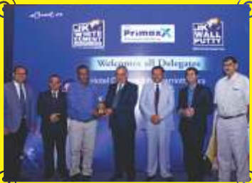
Shiv Shakti Stores - Winner, White Cement (Bihar)