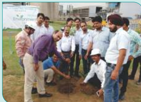
Staff members planting a sapling on the occasion of Environment Day