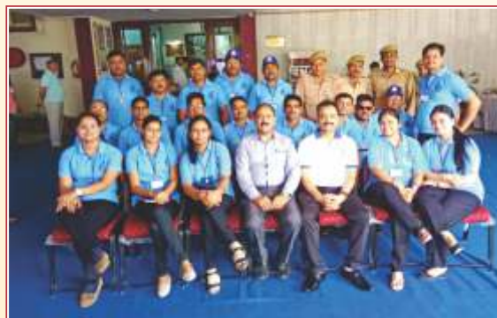
Team of volunteers who organized the desk