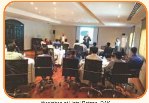
Workshop at Hotel Rotana, RAK