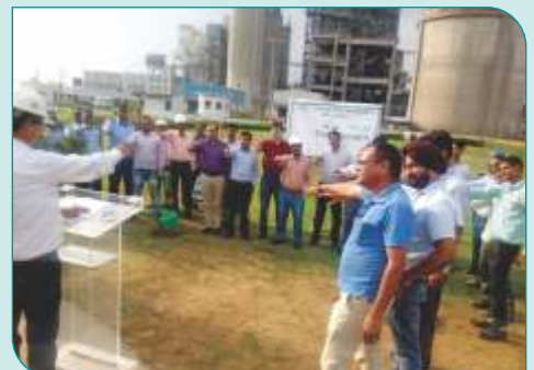
Oath taking on the occasion