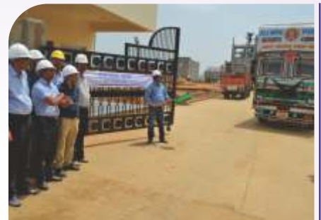
Flag-off of the first truck