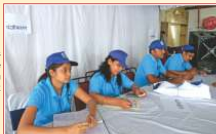
Volunteers handling the registration desk