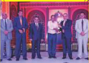
Interdominion Sales Agencies - Winner, White Cement (West Bengal)