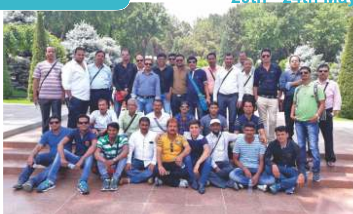
Company Officials & Dealers in Tashkent