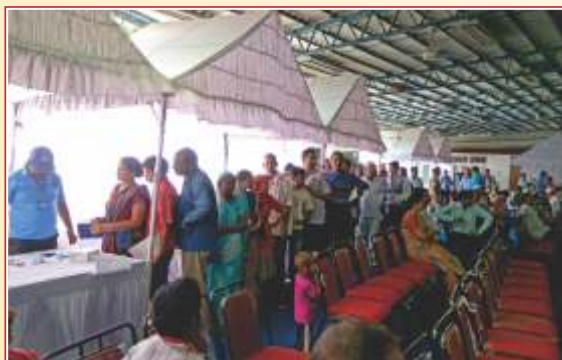
Help desk – Patients being directed to the respective doctors