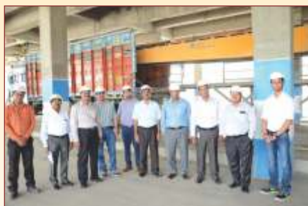
Bankers Inspecting the dispatches