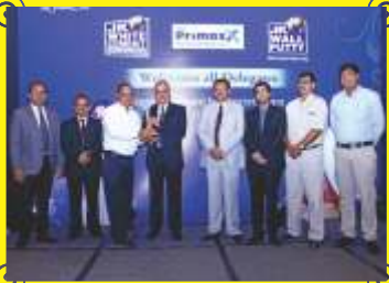
Diya Sales and Marketing - Winner, White Cement & Wall Putty (Jharkhand)

J .K. Cement's pioneering contribution and success in the Cement Industry has been majorly on the merit of our growing network of channel partners.