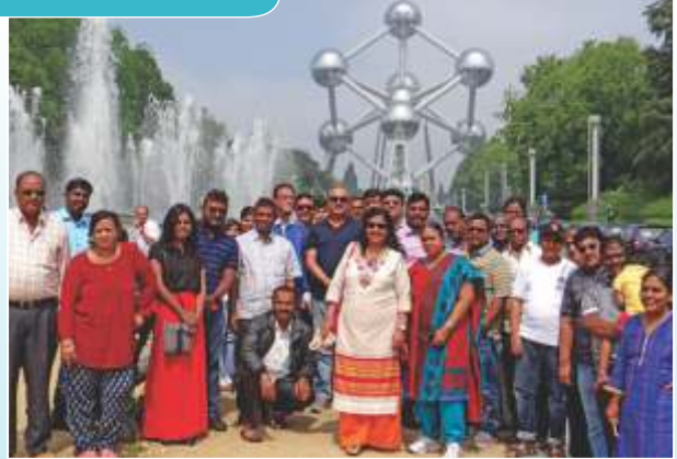
Company Officials & Dealers during the tour