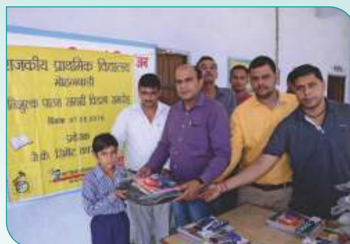
Jharli Staff members during book distribution at Mohanbari village.