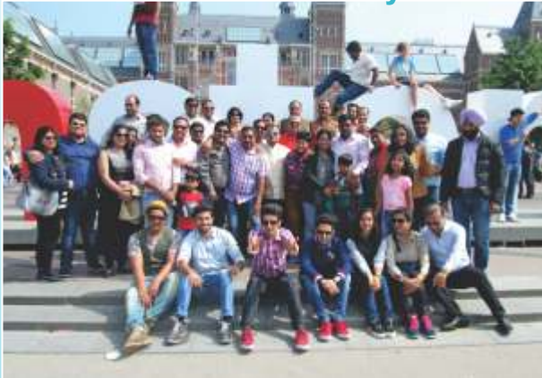
Company Officials & Dealers during the tour