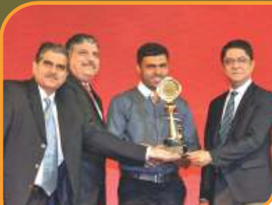
M/s TAS Marketing, Kerala getting felicitated for being the top performing stockist for F.Y. 2014-15