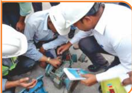
On the job training at Nirma Cement during training programme on Operation & Maintenance of gearboxes & alignment

We heartily welcome him to the J.K. Cement family and look forward to a fulfilling and mutually rewarding association