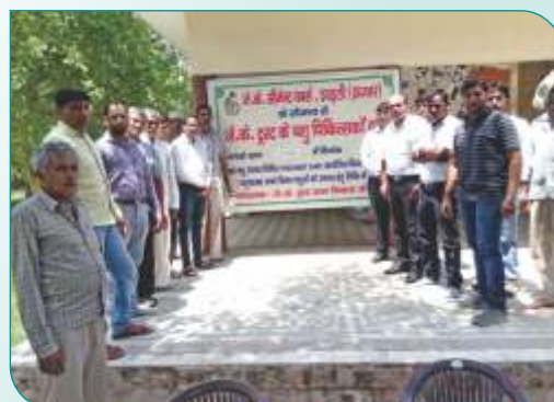
Staff members with J. K. Trust members and villagers

The camp was attended by around 200 farmers from surrounding villages. Many villagers appreciated the initiative taken by the plant. Villagers also acknowledged that these services help them gather proper knowledge and measures to maintain their cattle and livelihood.