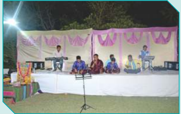
Sunder Kand Paath