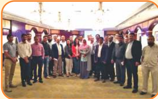
Participants & trainers at the workshop arranged at Hotel Ramada, Dubai

Awareness about internal customer, customer expectation, customer delight and understanding of organizational goals was discussed at the workshop which was held at Hotel Ramada.