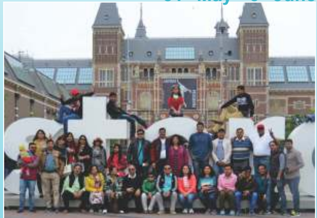
Company Officials & Dealers during the tour