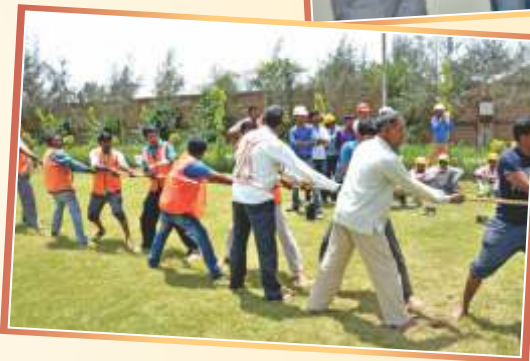
Workers participating in Tug-of-War