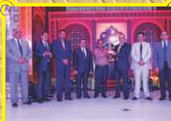
Pradeep & Company Pvt. Ltd - Winner, White Cement and Wall Putty (Nepal)