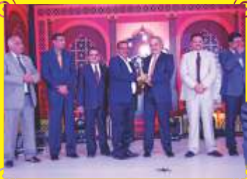
Mahalaxmi Steels - Winner, White Cement & Wall Putty (Odisha)