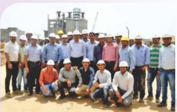
Company officials at J.K. White Katni