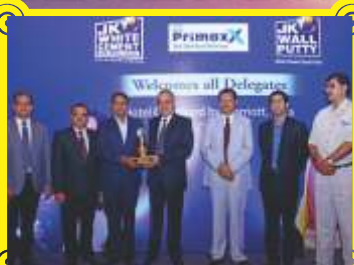
Ravi Hardware Stores - Winner, Wall Putty (Bihar)