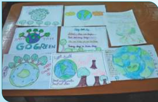
Paintings made by tiny tots of Padam Vidya Vihar