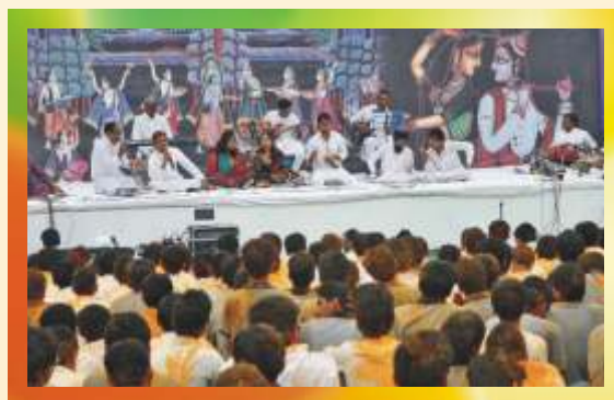
Group from Chhattisgarh performing on the occasion

The employees along with families of company and LKSEC staff and