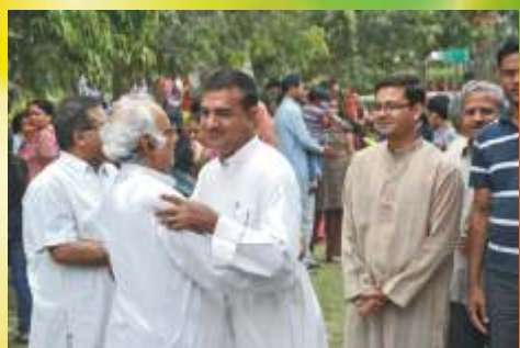
Company officials enjoying holi