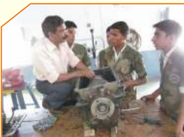
Practical demonstration to trainees of JKIT

Mahindra Navistar offered placements to all trainees of this trade after their NCVT exam at their works in Pune and various locations across the Country. JKIT is in the process of signing a MOU for training with Mahindra Navistar.