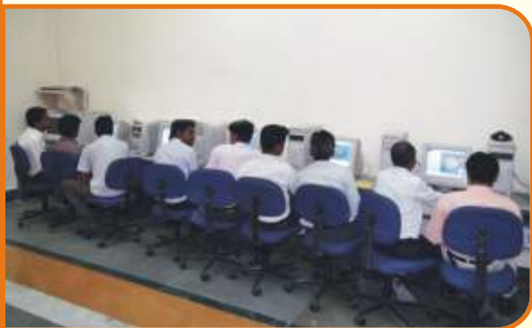
Training session in progress

The program was organized for Supervisors / Technicians / Electricians which was attended by nine participants from different cement plants of the region. Various practical problems and case studies were discussed during the program.