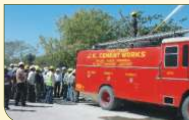
Demonstration of fire fighting equipment

In the final leg of safety week functions, on 15th March safety week concluding and prize distribution ceremony was held at Regional Training Centre (North).