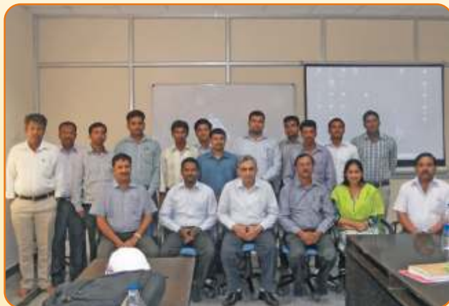
Batch 1 and Batch 2 at the plant orientation programme at Muddapur