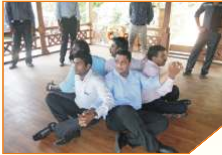
Activities conducted during the training programme