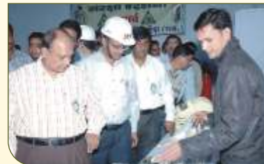
Guests viewing safety exhibition at Nimbahera