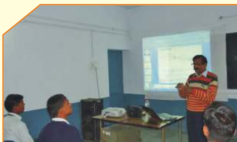
Training session in progress

We heartily welcome them to the J.K. Cement family and look forward to a fulfilling and mutually rewarding association